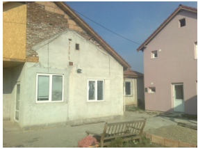
New location for Casa Shalom

For nearly 15 years, Oaza has been providing residential services in the form of family homes for the children placed under its care.